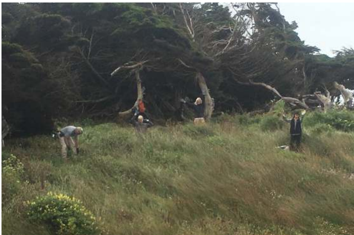
Part of the habitat restoration team at Baldwin Bluffs restoration site.