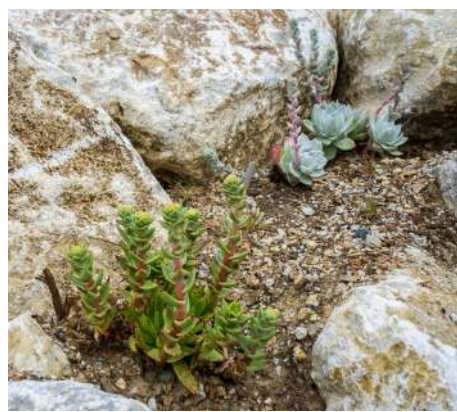
Newly planted dudleya in UCSC Arboretum rock garden.