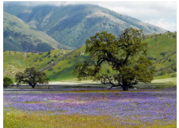
Tejon Ranch Oaks.

California is a globally significant biodiversity hotspot. With roughly 6,500 native plant taxa, the Golden State boasts similar botanical diversity to Japan and New Zealand. It's mild climates and rugged landscapes have also made California a highly desirable place to live, with a population close to 40 million people and growing. Demands for housing, resources, and a changing climate are placing increasing pressure on California's unique flora. Region-wide planning efforts are being developed to meet the demands of an increasing population.