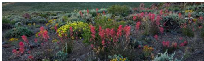
Bodie Hills, Mono County.