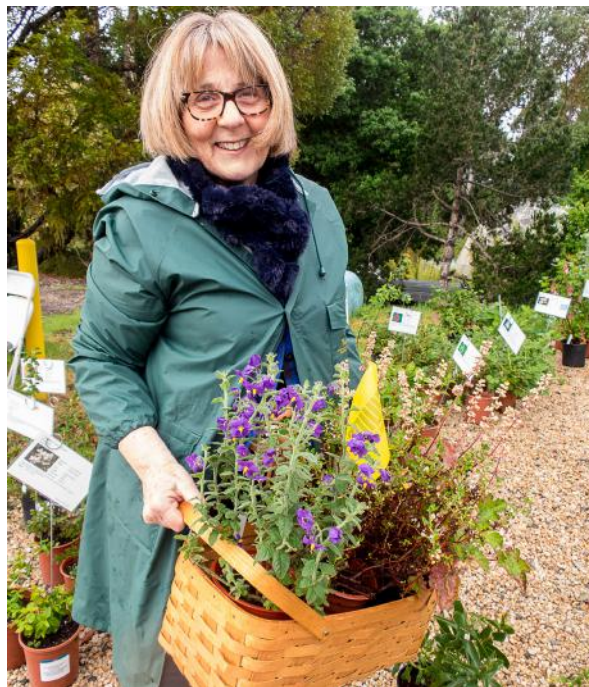
Happy native plant sale customer with Solanum xanti "Mountain Pride" and a Heuchera .

Please go to www.bigdayofgiving.org/CNPS to find out more and donate online.