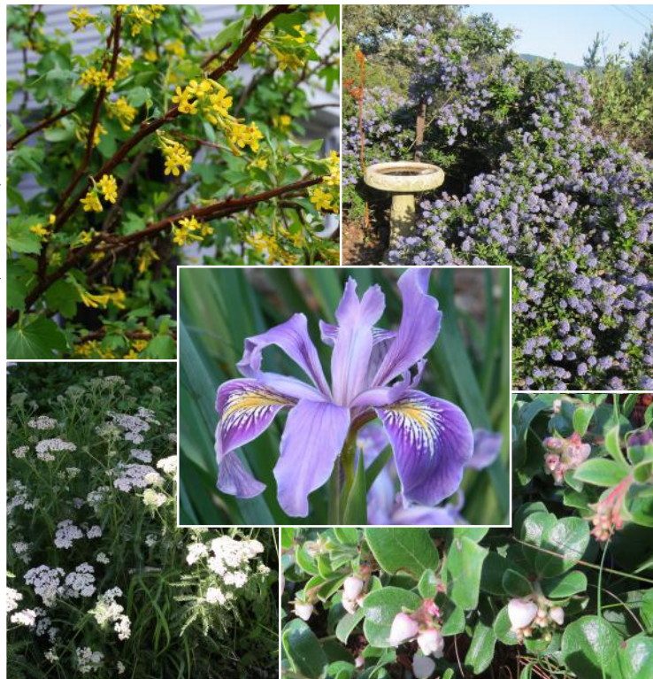
Pete Veilleux (Iris, Ribes), and Jackie Pascoe

With the spring plant sale coming up on April 18, it's time to have fun with garden planning. Maybe you'd like to put some Iris douglasiana in a bed that gets morning sun: what might go well with its blue and yellow blossoms and strappy dark green leaves? For low plants, how about choosing among yarrow ( Achillea millefolium ), Salvia 'Dara's Choice,' and a low-growing manzanita or ceanothus? For taller shrubs, perhaps a more upright manzanita or ceanothus, and one of the lovely early blooming species in the Ribes genus, maybe Ribes aureum to pick up on the yellow in the iris petals. I'm sure you'll have other ideas, and other garden spaces to imagineer... ∞